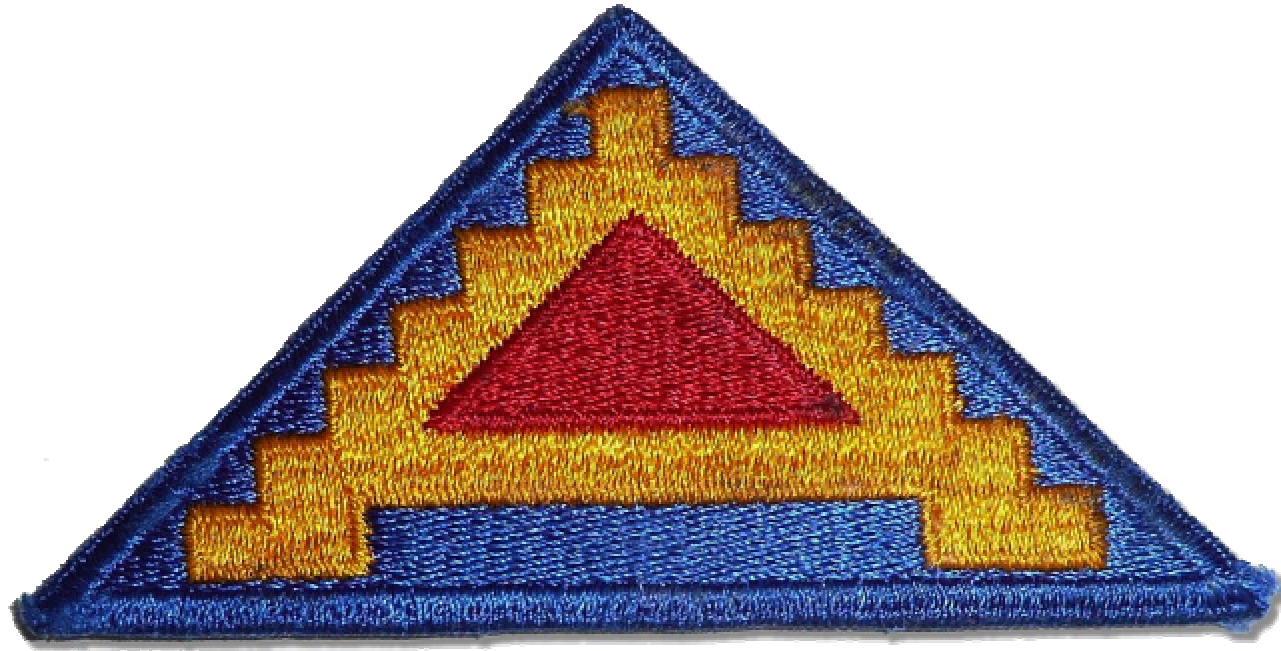
“Seven Steps to Hell”