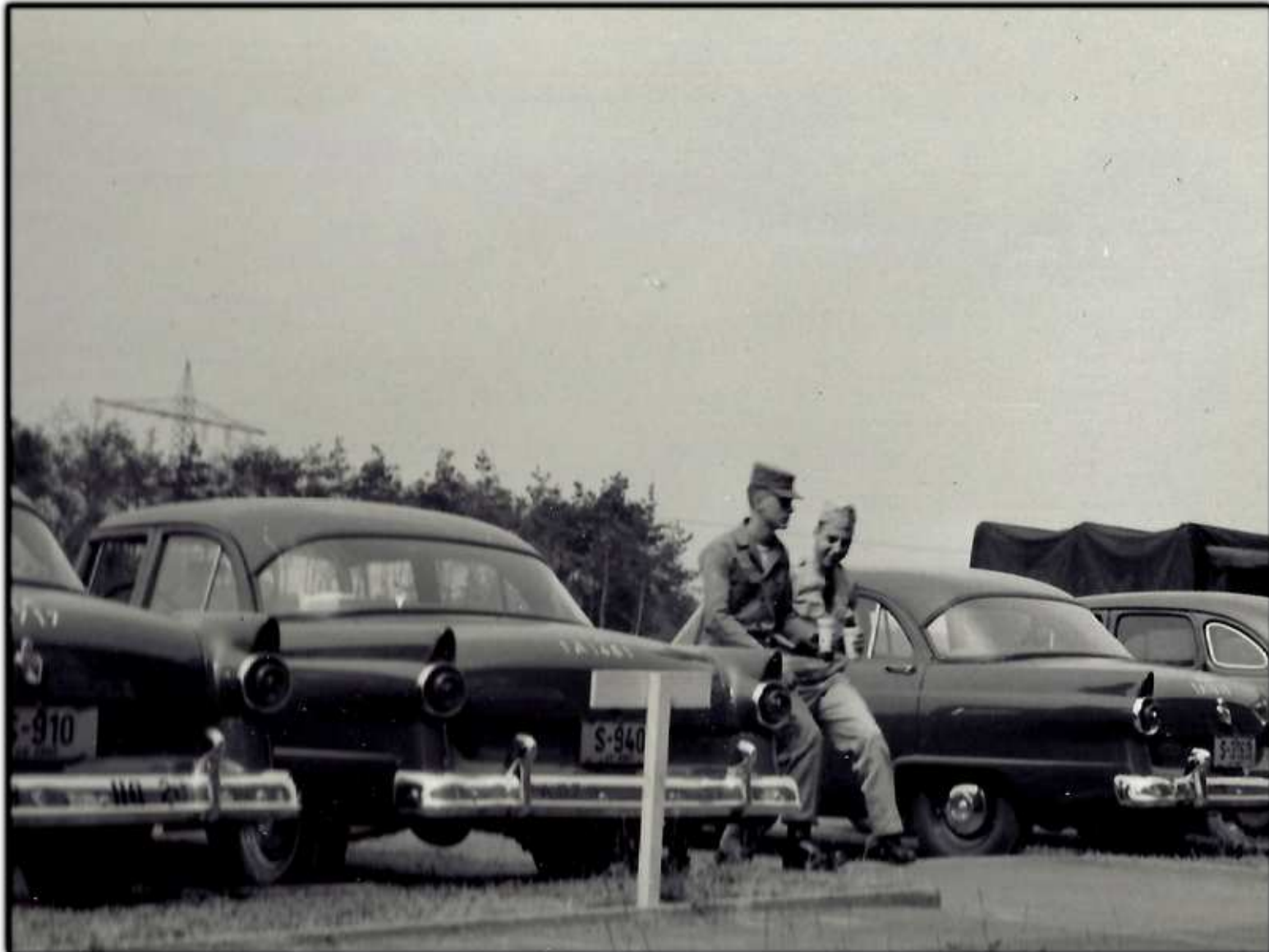
Deeley and Rashid—Coming back from Starbucks. Nice looking sedans.