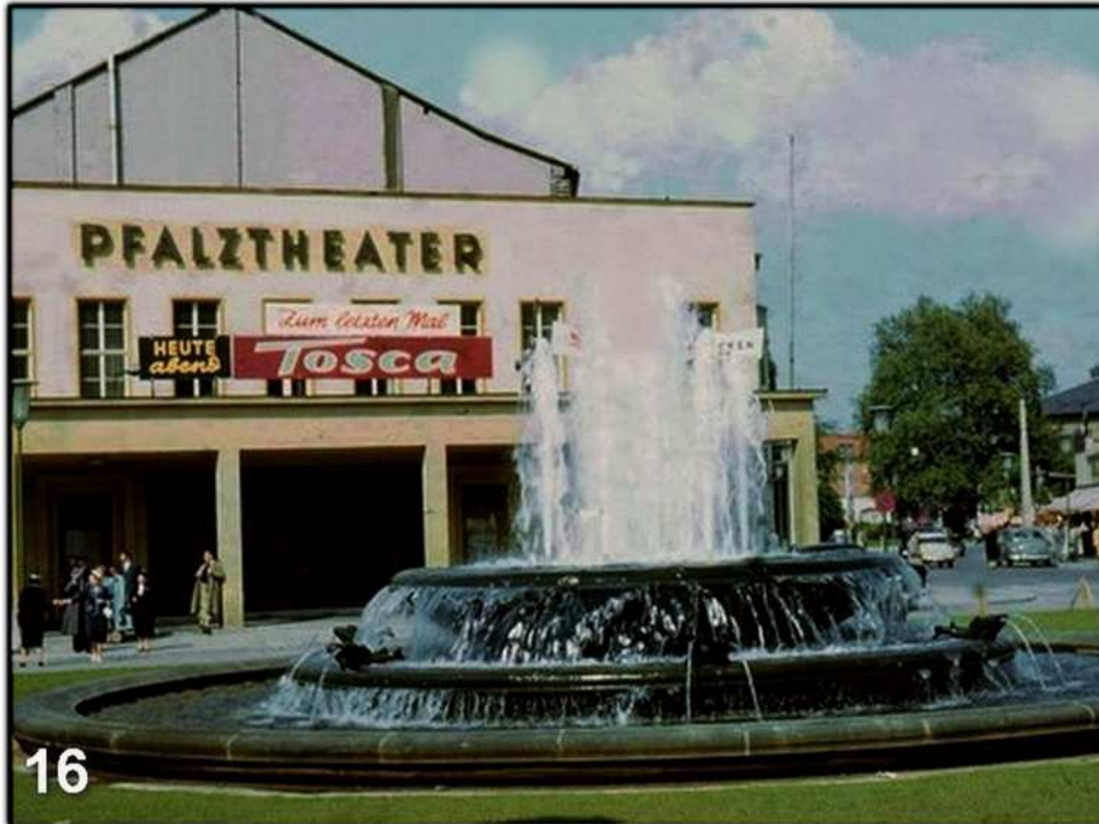
Downtown Kaiserslautern. I read one time that this area was the largest community of Americans outside of the U.S.