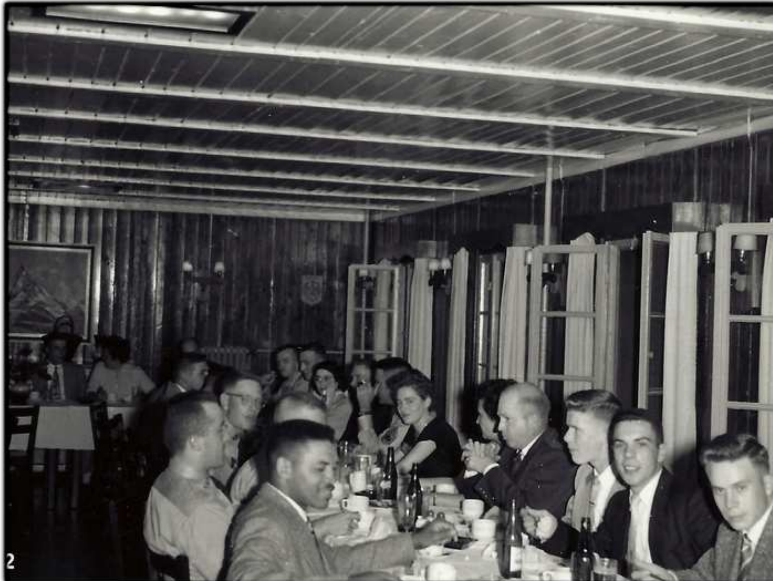
Lot's of familiar faces. Are you anywhere in here?