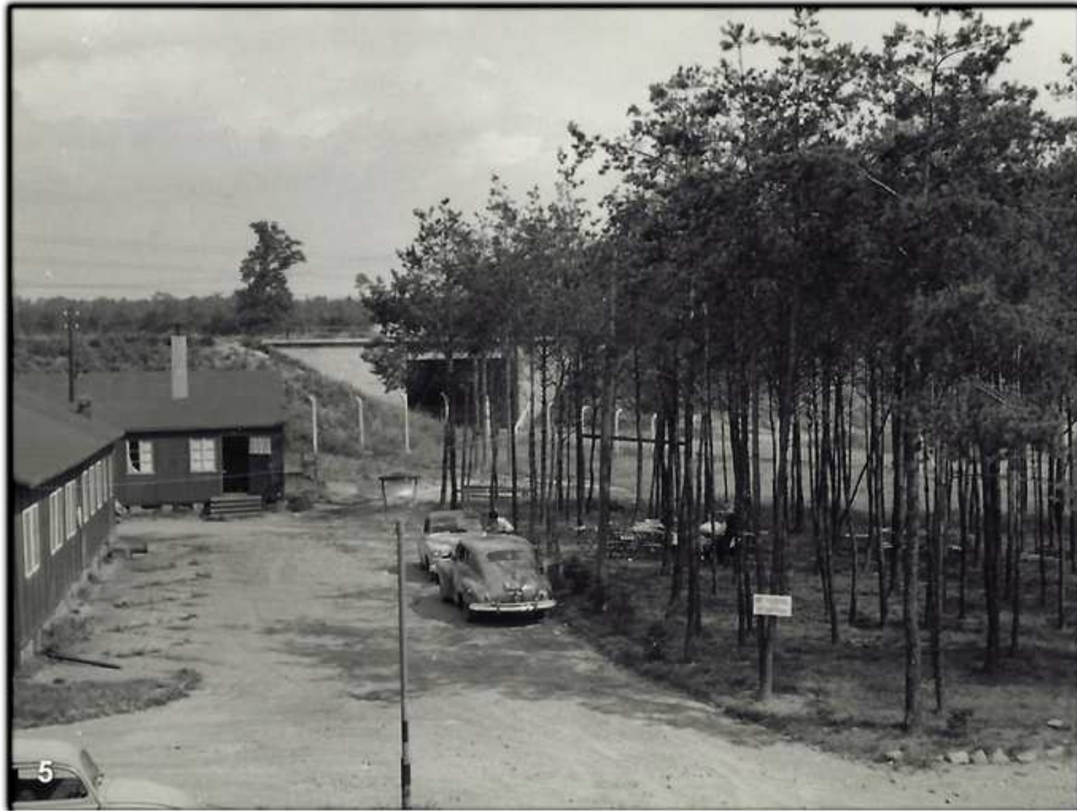
From out the back window of barracks--the EM club. (It really looks like a fire trap!)