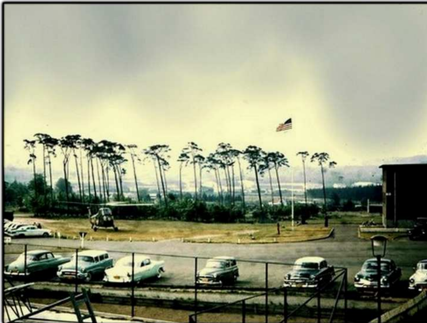
Headquarters building at far right. Nice collection of cars. 'Bet you can name all the years and makes. A collection like this must be worth several hundred thousand dollar now--in this condition. I'd love to have that Buick wagon! Note helicopter in background.