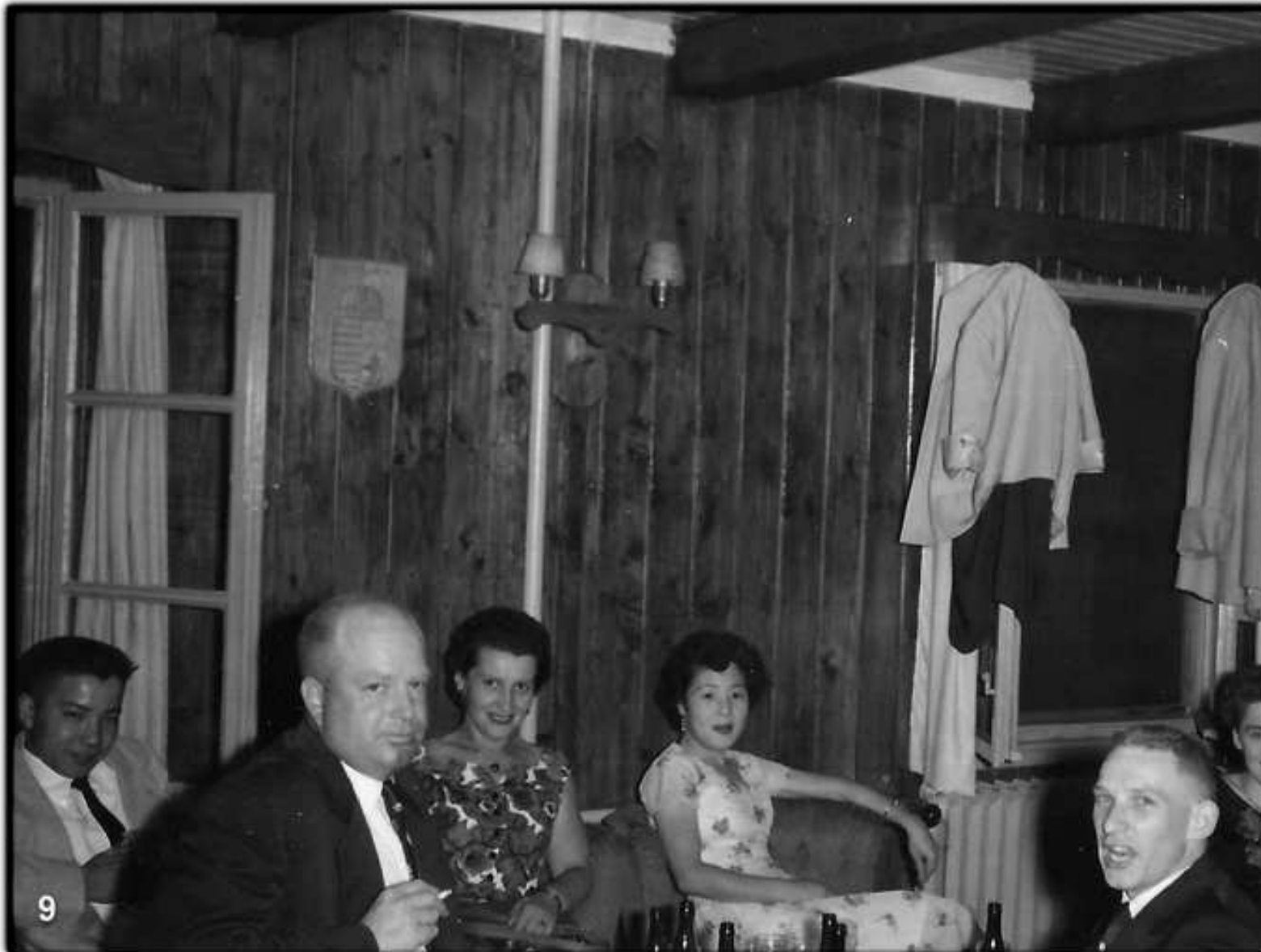
Is that the Chinese doctor at left? Seems at one time we had a company clerk that was Asian and from California.