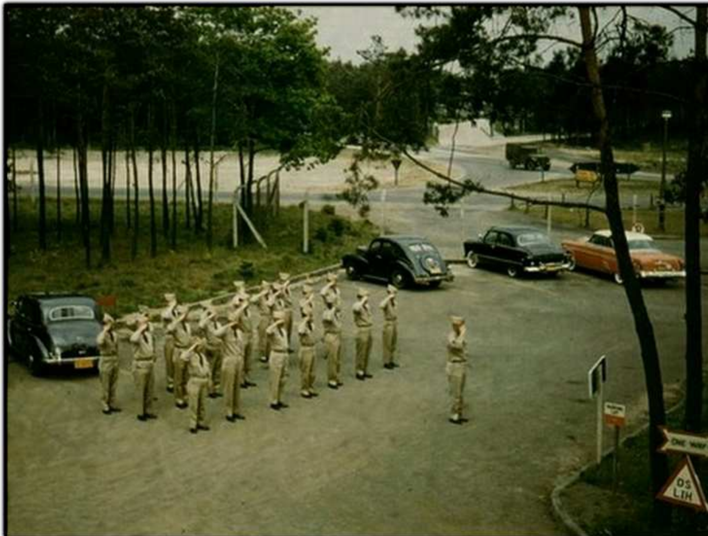
This was a rare "company formation." I think we had one of these for an IG inspection one time. As I recall the motor pool's job for the IG inspection was to dispatch on the road as many vehicle as possible, so they weren't around for inspection. Does this ring a bell, Dom?