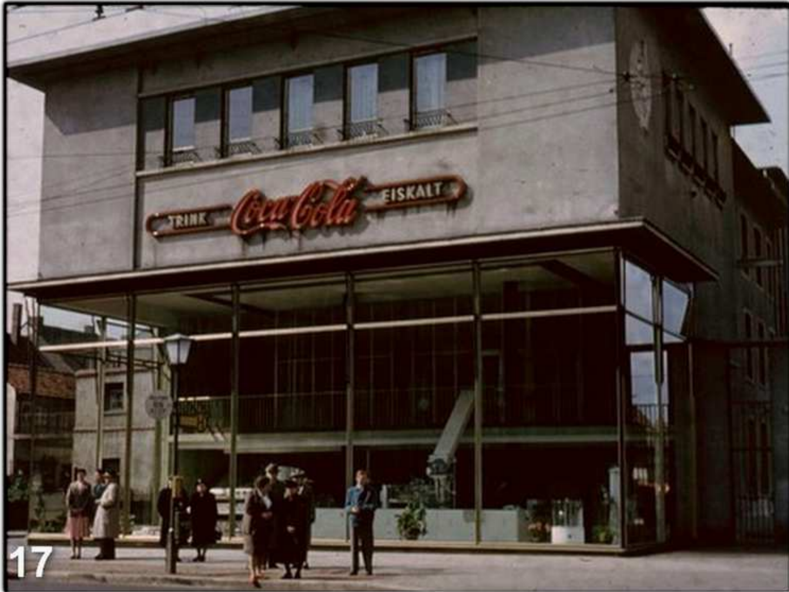
Downtown Kaiserslautern. Coca-Cola bottling plant