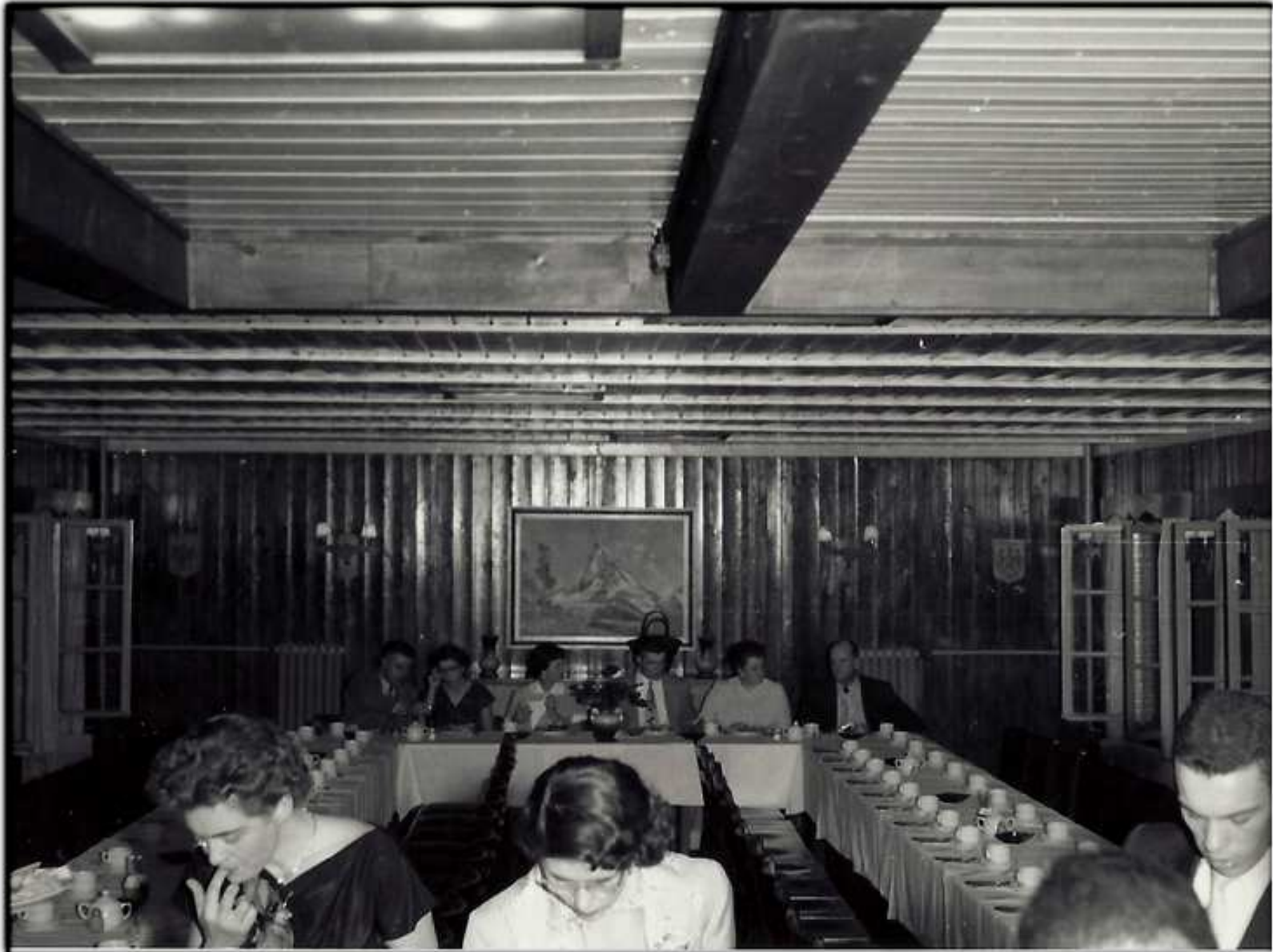
I thought the troops were supposed to be fed first! Look at all that wood! If this caught fire it would probably have gone up in 2 minutes. Thanks for all the windows.