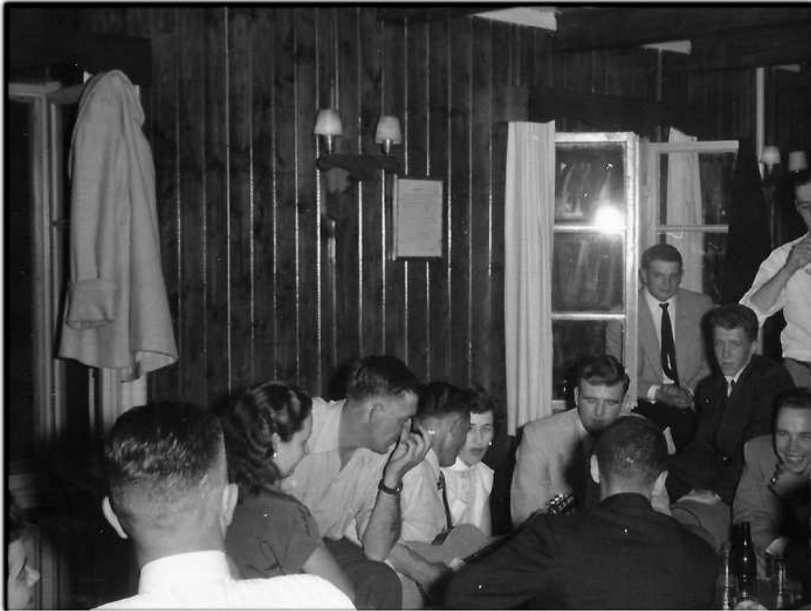
Someone entertaining the troops with the guitar