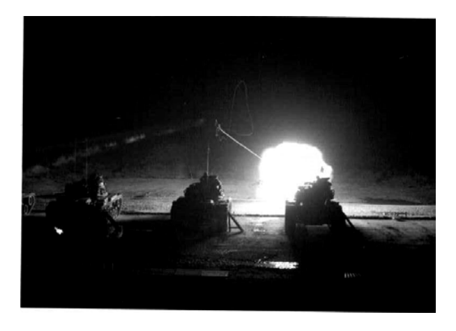
"KD" Phase 6 - Main Gun 105mm (Note: Xenon Searchlight (Left) from Target Acquiring Tank tracking (rail-mounted) target for the Firing M60A1 Tank - One Shot Down Range - "Steel-On-Steel")