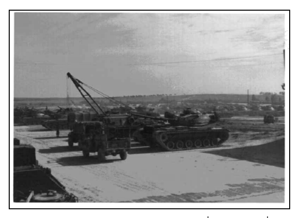
One of the Typical Track Parks Occupied by 2<sup>nd</sup>Sqdrn/3<sup>rd</sup>ACR at Grafenwőhr