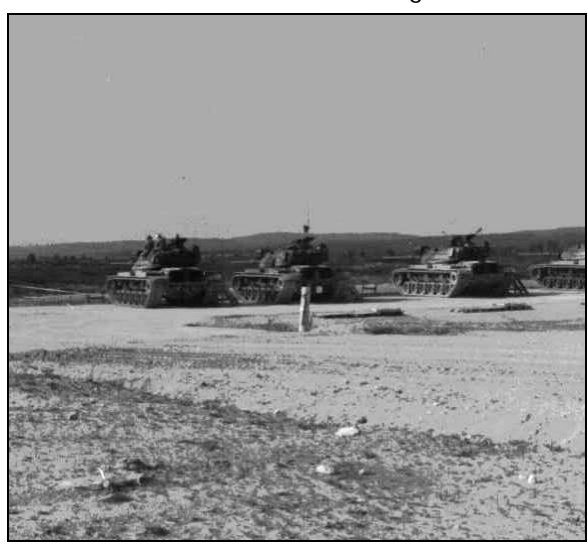
"KD" Phase 1 - Co-Ax & Cmdr Cupola MGs